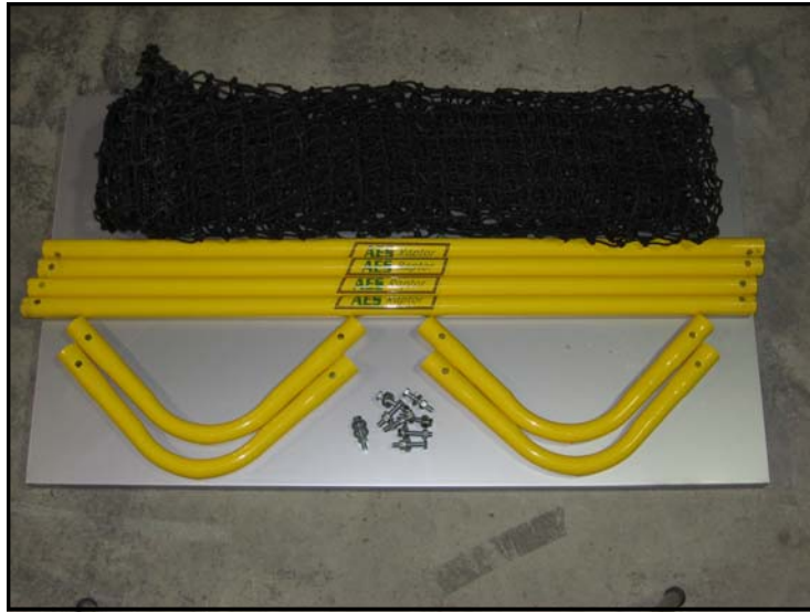
DIAGRAM OF PARTS

A Small (3x3 foot) or Standard (6x6 foot) SKYNET consists of the following parts, shown laid out in the photo above: