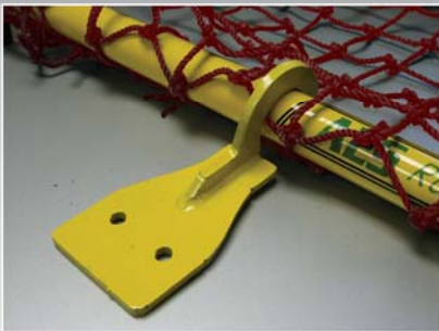
OPTIONAL SECURE-ATTACH BRACKETS FOR PERMANENT INSTALLATION

OSHA has issued standards, regulations and alerts notifying employers about the hazards of skylights. SKYNET is an easy-to-use, re-usable, cost-effective solution for skylight fall protection. Simply lay a SKYNET over a curbed skylight, and you're protected from falling through to the level below. Use a SKYNET on every skylight to meet OSHA regulations and requirements.