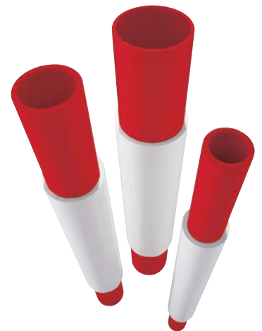
Three convenient sizes!